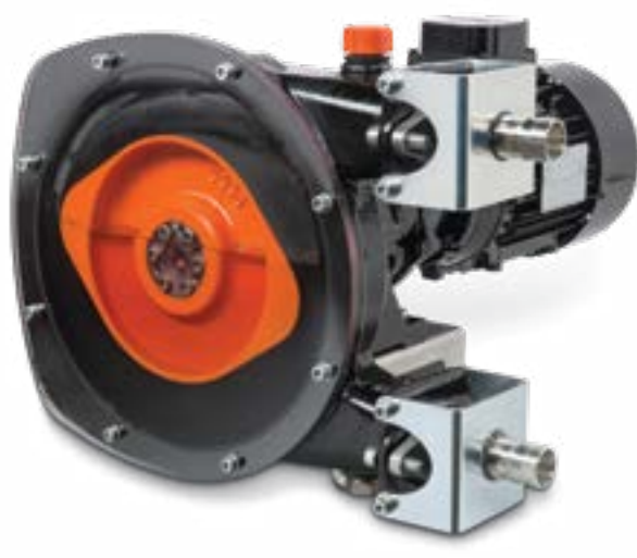
Abaque® Peristaltic (Hose) Pumps play a pivotal role in sludge removal during a wastewater-treatment operation thanks to their ability to run dry and effectively handle abrasive, particle-laden materials.

Industrial water or wastewater treatment, then, is a threestage process that must work hand-in-hand: initial floc formation with alum and ferric chloride, clump-strengthening with polymer, and removal and disposal of the sludge. Not all manufacturers of wastewater-treatment equipment are able to offer full lines of pumping and polymer- blending technology for the required water- treatment applications.